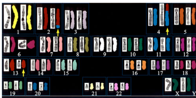
Fig. 2 Chromosome analysis of 13q-syndrome using SKY showing structural abnormalities in chromosomes 2, 4, and 13

When performing tests using SKY, it is necessary to understand the characteristics and the limitations of this analysis, and to combine the test results with those of